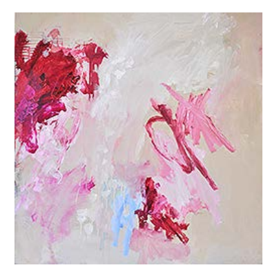
Jo Davenport Poetry in Pink I 2015 oil on board, framed 90cm x 90cm