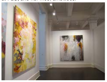
JO DAVENPORT PROFILE DOWNLOAD BIO / CV (PDF)