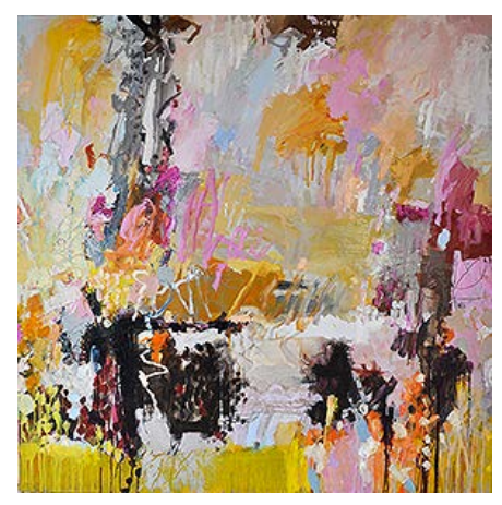
Jo Davenport Unfolded Reflections 2015 oil on Belgian linen 153cm x 153cm