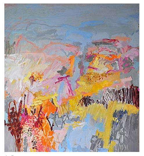
Jo Davenport In the Clear Light of Day 2015 oil on Belgian linen 183cm x 168cm