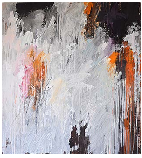
Jo Davenport Bridal River 2015 oil on Belgian linen 183cm x 168cm