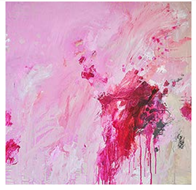
Jo Davenport Poetry in Pink II 2015 oil on board, framed 90cm x 90cm