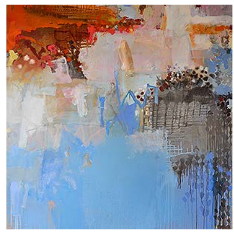
Jo Davenport Under a Blue Sky 2015 oil on Belgian linen 153cm x 153cm