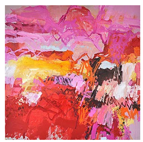
Jo Davenport Pink Field 2015 oil on Belgian linen 153cm x 153cm