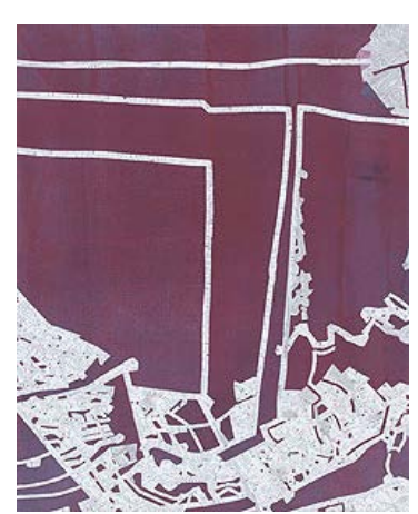
Christophe Stibio Tram Route 57 2014 natural pigments, shredded documents and rice paper on canvas 85cm x 70cm