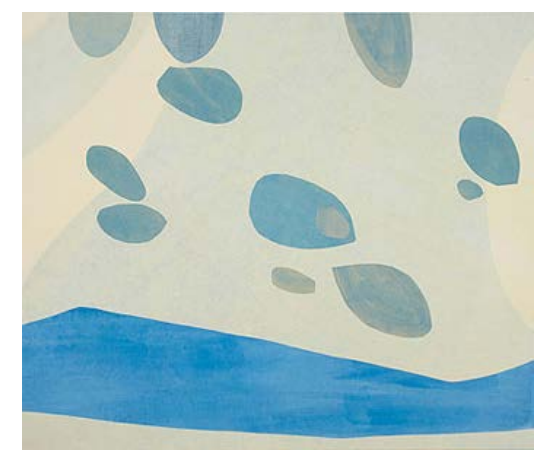
Christophe Stibio Soakage 2014 natural pigments and rice paper on canvas 120cm x 140cm

Christophe Stibio is not afraid of the land. He endeavours to plough it mentally. He is determined to go deeper, to explore what is under its skin. His art is the visual and tangible result of a profound mental geology of a country which has both physical and spiritual dimensions.