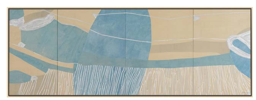
Christophe Stibio Drying Ponds in Coastal Fire Trail 2013 natural pigments, shredded documents and rice paper on canvas (framed) 89cm x 250cm