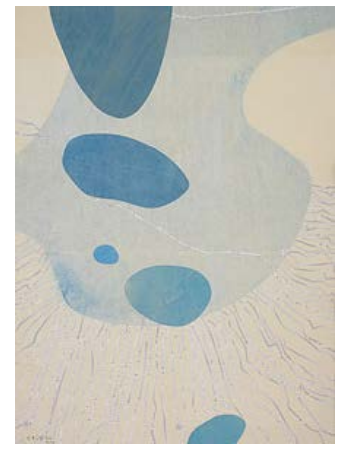
Christophe Stibio More Drying Ponds 2014 Natural pigments, shredded documents and rice paper on canvas 150cm x 110cm

In his work Christophe Stibio shows simultaneously the transient character of a society based on a vision of the short term gain and instant gratification, more often than not to the detriment of the land, and the timeless monumentality of the features of the land. Like a surrealistic partitur of paper snippets, letters, numbers and signs forming the incongruent notes of a eulogy of the land, these pictures let themselves read as rhythmic abstracted maps of landscapes. They are encoded landscapes in which a meeting of different codes takes place that reflect a complex and fragile equilibrium between man and environment, life and resources, natural environment and urbanisation. These pictures are also a strong reminder that no human intervention or interference will leave the landscape unaffected.