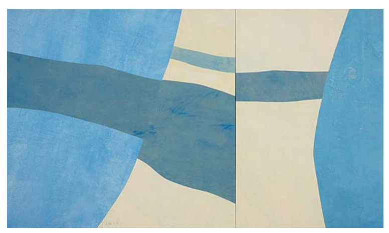
Christophe Stibio Just a Mirage 2014 natural pigments and rice paper on canvas 105cm x 175cm