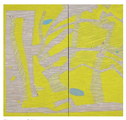
Christophe Stibio Beach No. 16 2014 natural pigments, shredded documents and rice paper on canvas 95cm x 102cm