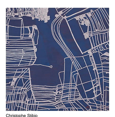
A May - The Housing Commissions, the Primary School, the Silos and the Brothel 2014 natural pigments, shredded documents and rice paper on canvas 106cm x 106cm