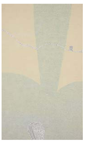
Christophe Stibio Is This an Ant Track, a Pebble And a Rock? 2014 natural pigments, shredded documents and rice paper on canvas 100cm x 60cm