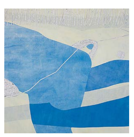
Christophe Stibio Sitting by Some Drying Ponds Roberto I Love You 2014 natural pigments, shredded documents and rice paper on canvas 110cm x 110cm