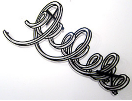
You Live OS 2013 118 x 66cm powdercoated mild steel