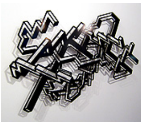
On your roof 2013 71 x 103cm powdercoated mild steel