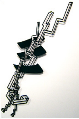
Moves 2013 168 x 59 cm powdercoated mild steel