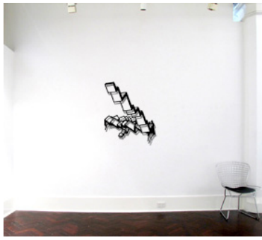
Artwork in situ on 3.7m wall