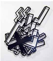
18th place 2013 37 x 47cm powdercoated mild steel