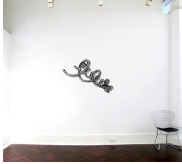
Artwork in situ on 3.7m wall