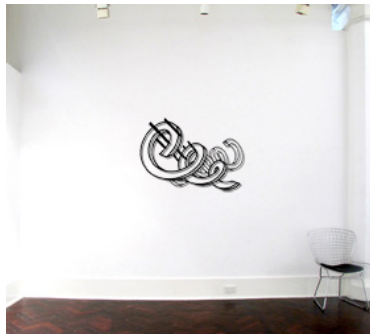
Artwork in situ on 3.7m wall