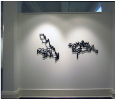
Exhibition installation views