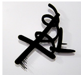
Waiting outside 2013 44 x 35cm powdercoated mild steel