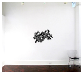
Artwork in situ on 3.7m wall