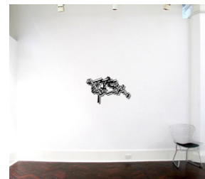
Artwork in situ on 3.7m wall