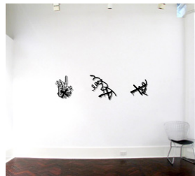
Artwork in situ on 3.7m wall