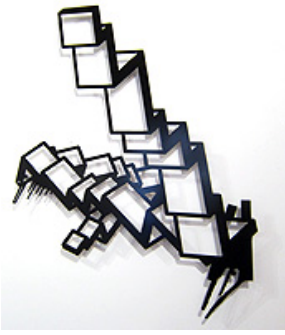
Logan Sq 2013 99 x 60cm powdercoated mild steel