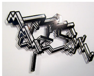
Emergency Exit 2013 59 x 93cm powdercoated mild steel