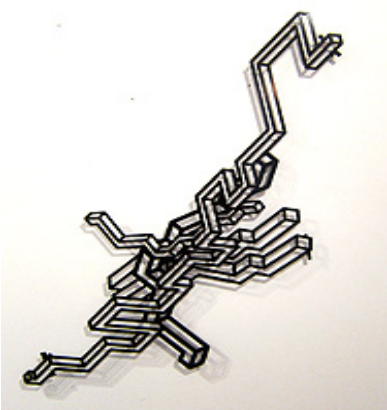
Cab on the Dan Ryan 2013 137 x 57cm powdercoated mild steel