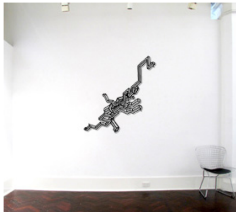
Artwork in situ on 3.7m wall