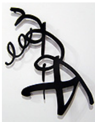
Bump into you 2013 58 x 27cm powdercoated mild steel