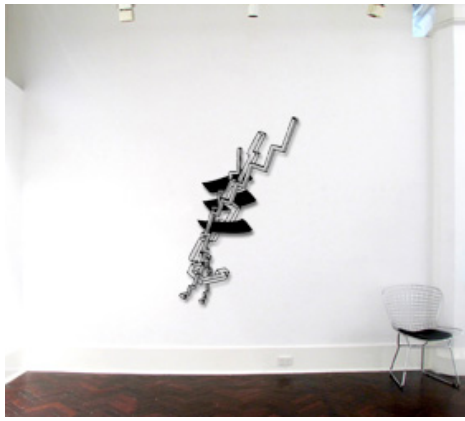
Artwork in situ on 3.7m wall