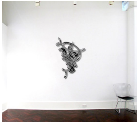
Artwork in situ on 3.7m wall