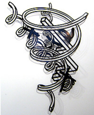
Out late 2013 126 x 100 cm powdercoated mild steel