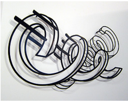
Ashland and Division 2013 72 x 120cm powdercoated mild steel