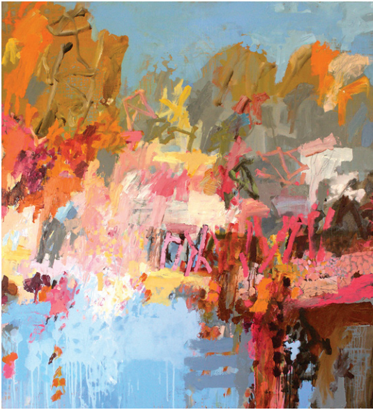
Horseshoe Lagoon Jetty 2016 oil on Belgian linen 183cm x 168cm