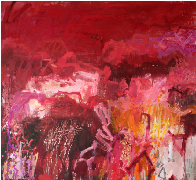
Red Sky to Night 2016 oil on Belgian linen 168cm x 183cm