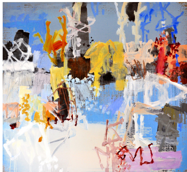
Winter Wetlands 2016 oil on Belgian linen 168cm x 183cm