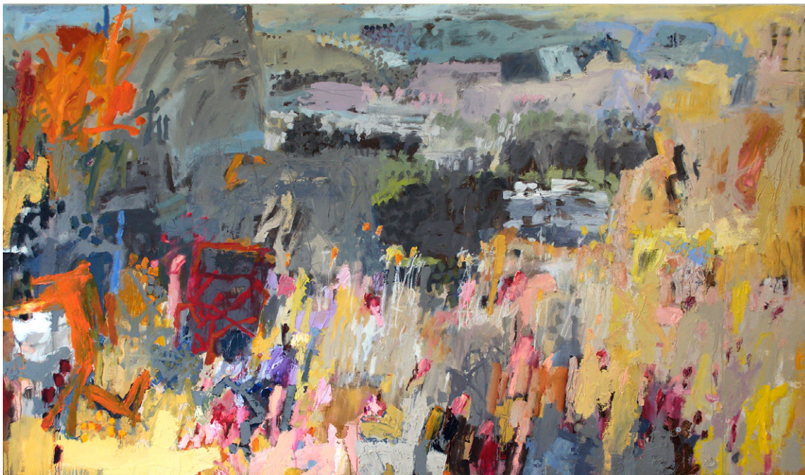
Picnic on the Ridge 2016 oil & beeswax on Belgian linen 153cm x 263cm