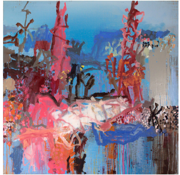
View From the Pines 2016 oil on Belgian linen 153cm x 153cm