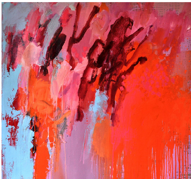
Morning Has Broken II 2016 oil on Belgian linen 92cm x 92cm