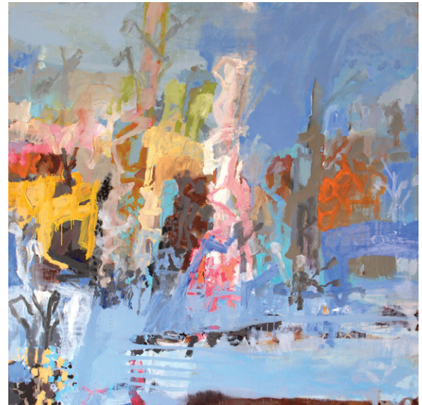
Still Water 2016 oil on Belgian linen 153cm x 153cm