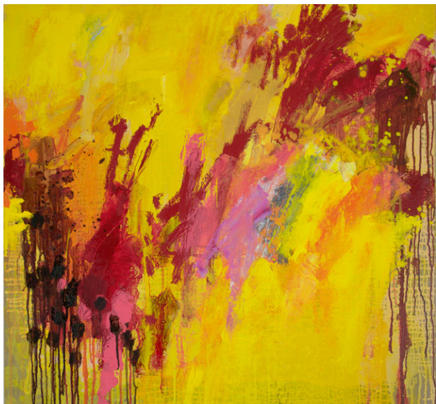
After Winter, Spring 2016 oil on Belgian linen 92cm x 92cm