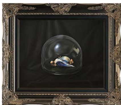
Michelle Molinari Everlasting 2014 oil on linen 41cm x 51cm , 60 x 70 cm framed