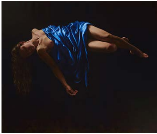
Claire Bridge Dark Matters 2014 oil on linen 104cm x 123cm