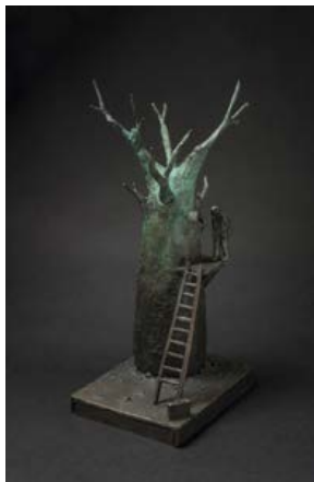
Jon Eiseman Seeking Wisdom 2014 unique bronze 38cm x 20cm x 14 cm