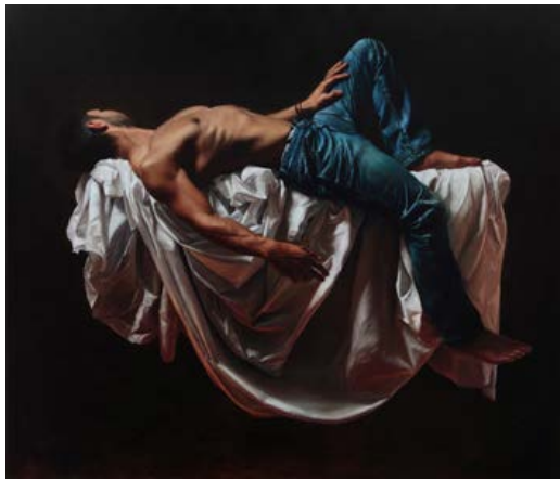
Claire Bridge Dark Matters II 2014 oil on linen 104cm x 123cm