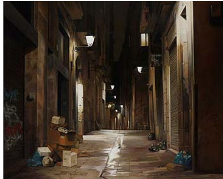
Garry Pumfrey Dagueria 2014 oil on linen 65cm x 81cm