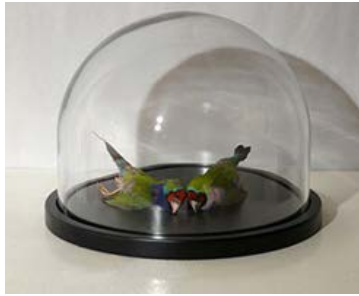
Michelle Molinari Forever By Your Side 2014 taxidermy Gouldian finches, glass dome, acrylic base 23cm x 23cm x 18 cm