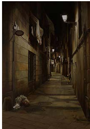
Garry Pumfrey Reset 2014 oil on linen 92cm x 65cm