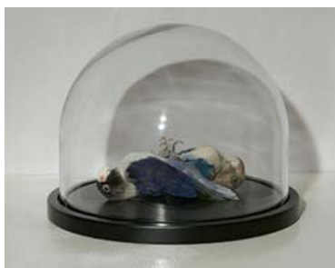
Michelle Molinari Everlasting 2014 taxidermy love birds, glass dome, acrylic base 23cm x 23cm x 18 cm