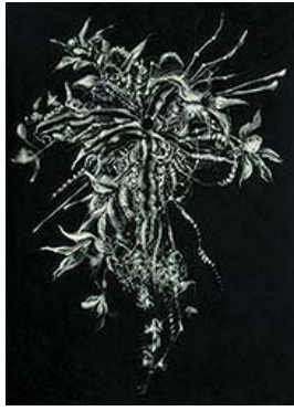
Gina Kalabishis Sheath 2014 pastel on velour paper (framed) 70cm x 50cm