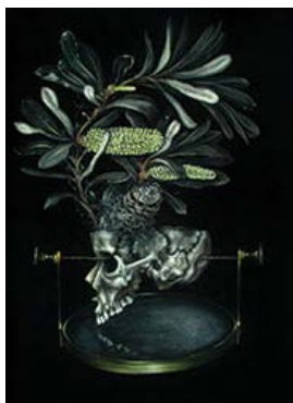
Gina Kalabishis Arachne 2014 pastel on velour paper (framed) 70cm x 50cm

pastel on velour paper (framed) 70cm x 50cm