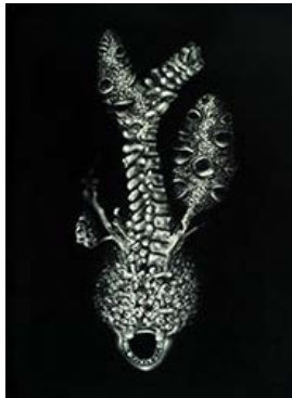
Gina Kalabishis Lumbago 2013 pastel on velour paper (framed) 70cm x 50cm