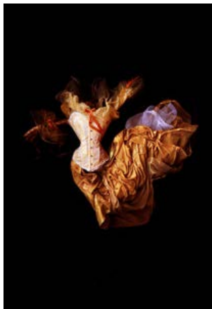
Meg Cowell There is a Bluebird in my Heart 2014 giclee print, framed, 1 of 5ed remain 133cm x 92cm