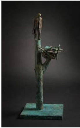
Jon Eiseman Nest 2014 unique bronze 72cm x 27cm x 25 cm