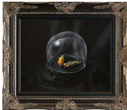
Michelle Molinari Until Death 2014 oil on linen 41cm x 51cm , 60 x 70 cm framed