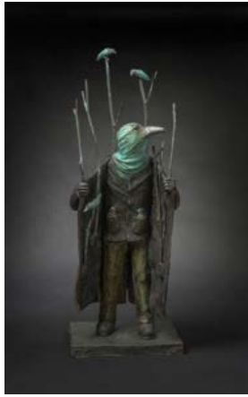
Jon Eiseman Sanctuary 2014 unique bronze 67cm x 24cm x 18cm