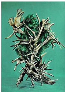
Gina Kalabishis Sparrow's Stump 2014