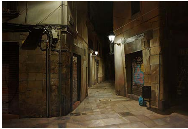
Garry Pumfrey Blanqueria 2014 oil on linen 89cm x 131cm