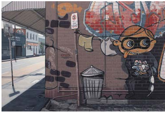
William Breen Snowdrapper 2014 oil on linen 71cm x 107cm

137 FLINDERS LANE MELBOURNE 3000 TUES-FRI 11AM TO 6PM, SAT 11AM TO 5PM + 61 3 9654 3332 INFO@FLG.COM.AU