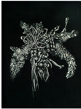
Gina Kalabishis The Natives are all Sorts 2014 pastel on velour paper (framed) 70cm x 50cm