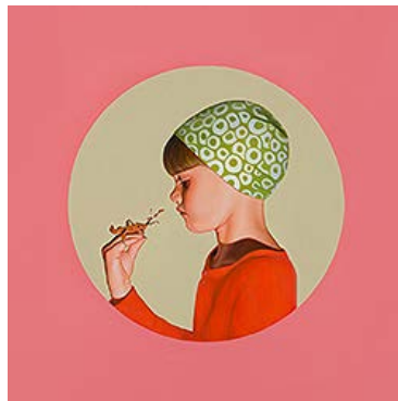
Rebecca Hastings Sticky Fingers 2014 oil on board 70cm x 70cm