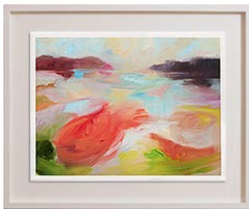
Claire Bridge Future Memory XV 2015 oil on paper 31cm x 41cm , (43 x 53cm framed)