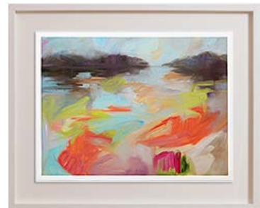
Claire Bridge Future Memory VIII 2015 oil on paper 31cm x 41cm , (43 x 53cm framed)