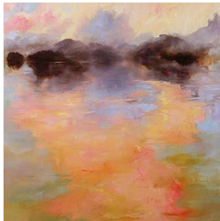
Claire Bridge You are my mountain, I am your cloud 2015 oil on linen 152cm x 152cm