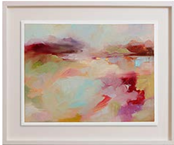
Claire Bridge Future Memory III 2015 oil on paper 31cm x 41cm , (43 x 53cm framed)