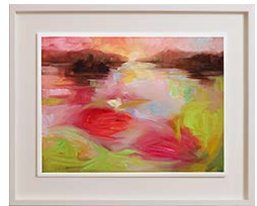
Claire Bridge Future Memory XVI 2015 oil on paper 31cm x 41cm , (43 x 53cm framed)