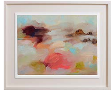
Claire Bridge Future Memory IV 2015 oil on paper 31cm x 41cm , (43 x 53cm framed)