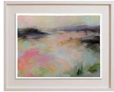
Claire Bridge Future Memory II 2015 oil on paper 31cm x 41cm , (43 x 53cm framed)