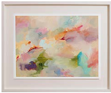
Claire Bridge Future Memory XVII 2015 oil on paper 31cm x 41cm , (43 x 53cm framed)