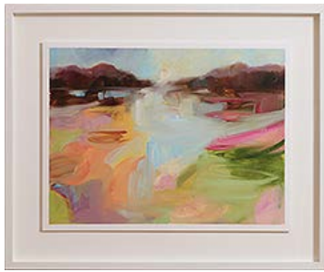
Claire Bridge Future Memory XIII 2015 oil on paper 31cm x 41cm , (43 x 53cm framed)