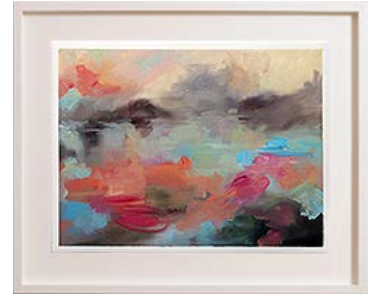
Claire Bridge Future Memory XX 2015 oil on paper 31cm x 41cm , (43 x 53cm framed)