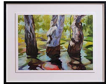
Claire Bridge Future Dreaming II 2015 oil on Arches cotton paper 31cm x 41cm , (43 x 53 cm framed.)

CLAIRE BRIDGE PROFILE DOWNLOAD BIO / CV (PDF)