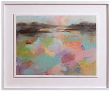
Claire Bridge Future Memory XXI 2015 oil on paper 31cm x 41cm , (43 x 53cm framed)