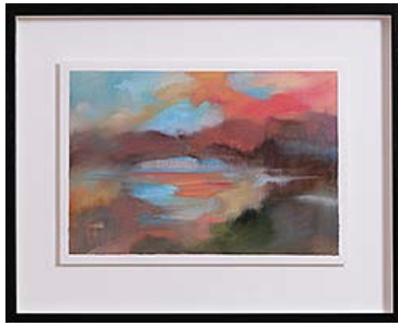
Claire Bridge Future Memory I 2015 oil on paper 21cm x 29cm