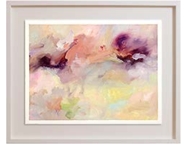
Claire Bridge Future Memory XII 2015 oil on paper 31cm x 41cm , (43 x 53cm framed)