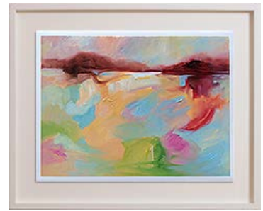
Claire Bridge Future memory XIV 2015 oil on paper 31cm x 41cm , (43 x 53cm framed)