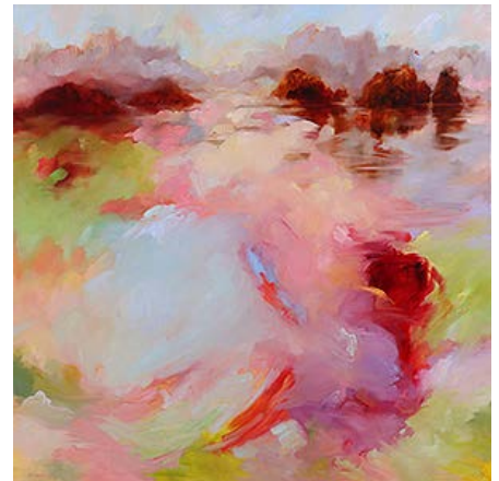
Claire Bridge Open the floodgates, you are the poem in my song 2015 oil on linen 152cm x 152cm