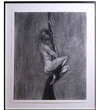
Claire Bridge Threads of Memory 2015 charcoal on Fabriano paper 70cm x 57cm , (82 x 69cm framed)