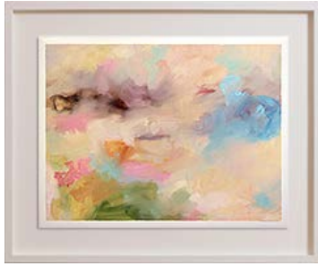
Claire Bridge Future Memory XI 2015 oil on paper 31cm x 41cm , (43 x 53cm framed)