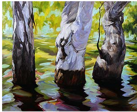
Claire Bridge Future Dreaming 2015 oil on linen 77cm x 96cm

fleeting notions, Bridge has used her figures to anchor her ephemeral landscapes. Moving between fluid brushstrokes, flurries of colour, emanations of beauty, spontaneity of movement and subtle depiction of form, she has carefully situated the figurative within an abstracted mode of meditation.