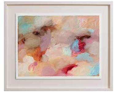
Claire Bridge Future Memory X 2015 oil on paper 31cm x 41cm , (43 x 53cm framed)