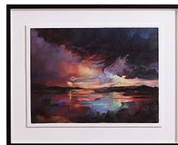
Claire Bridge Spend this night with me and I will tell you the secrets of all things 2015 oil on Arches cotton paper 31cm x 41cm , (43 x 53 cm framed.)