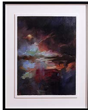
Claire Bridge Night's Secrets I 2015 oil on Arches cotton paper 41cm x 31cm , (53 x 43 cm framed)