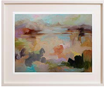
Claire Bridge Future memory XIX 2015 oil on paper 31cm x 41cm , (43 x 53cm framed)