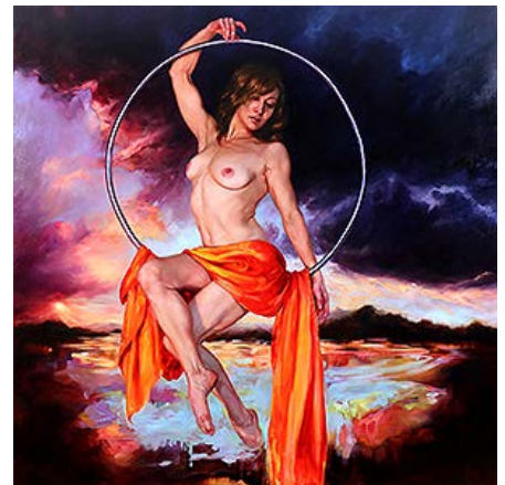
Claire Bridge Future Spill 2015 oil on linen 152cm x 152cm