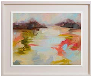
Claire Bridge Future Memory VII 2015 oil on paper 31cm x 41cm , (43 x 53cm framed)