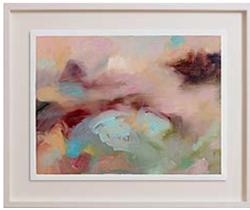
Claire Bridge Future Memory IX 2015 oil on paper 31cm x 41cm , (43 x 53cm framed)