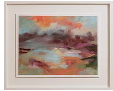
Claire Bridge Future Memory XVIII 2015 oil on paper 31cm x 41cm , (43 x 53cm framed)