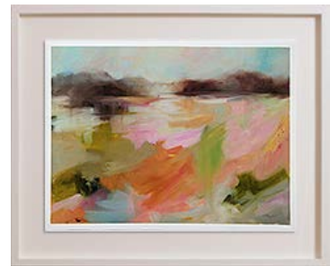
Claire Bridge Future Memory VI 2015 oil on paper 31cm x 41cm , (43 x 53cm framed)