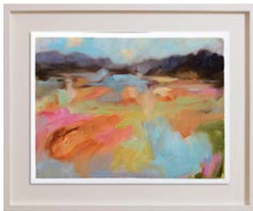
Claire Bridge Future Memory V 2015 oil on paper 31cm x 41cm , (43 x 53cm framed)