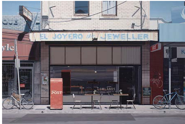
William Breen Lowlands 2014 oil on linen 92cm x 137cm