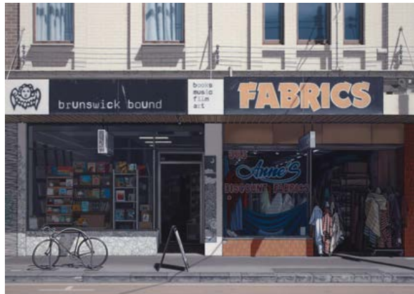
William Breen Fabrics 2014 oil on linen 107cm x 153cm