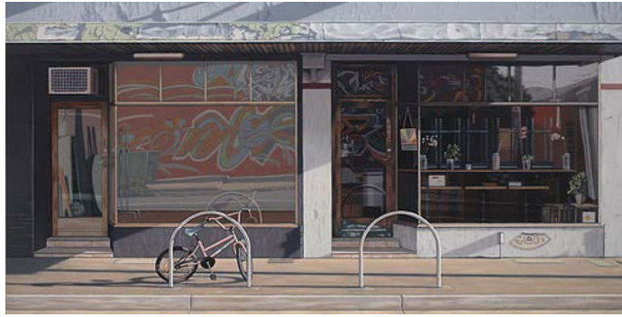
William Breen New Day Rising 2014 oil on linen 76cm x 153cm