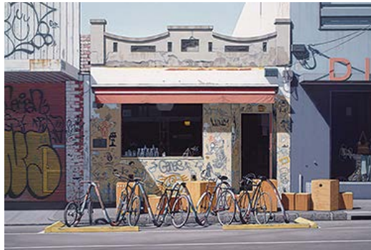
William Breen Wild West 2014 oil on linen 92cm x 137cm