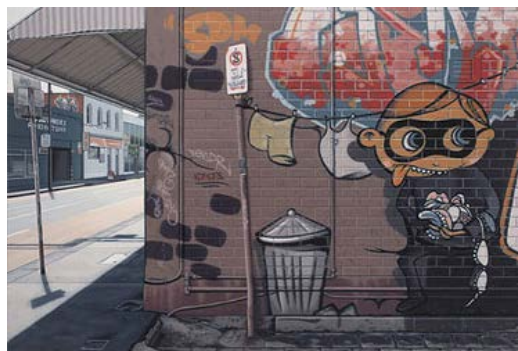
William Breen Snowdropper 2014 oil on linen 71cm x 107cm