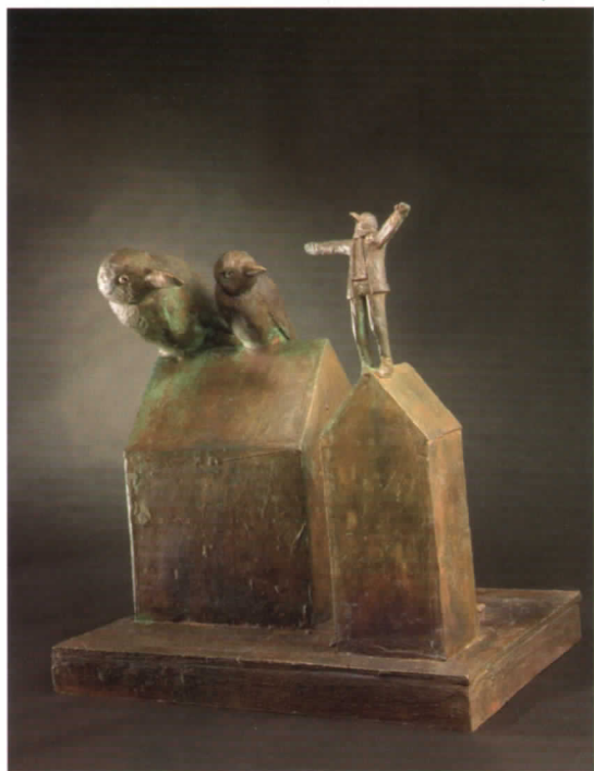
羽翼初成/ Fledgling 青铜/Bronze 2009年 35×34×24cm