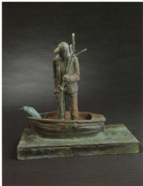
吾将上下而求索/ Show Me the Way 青铜/Bronze 2009年 23×24×13cm