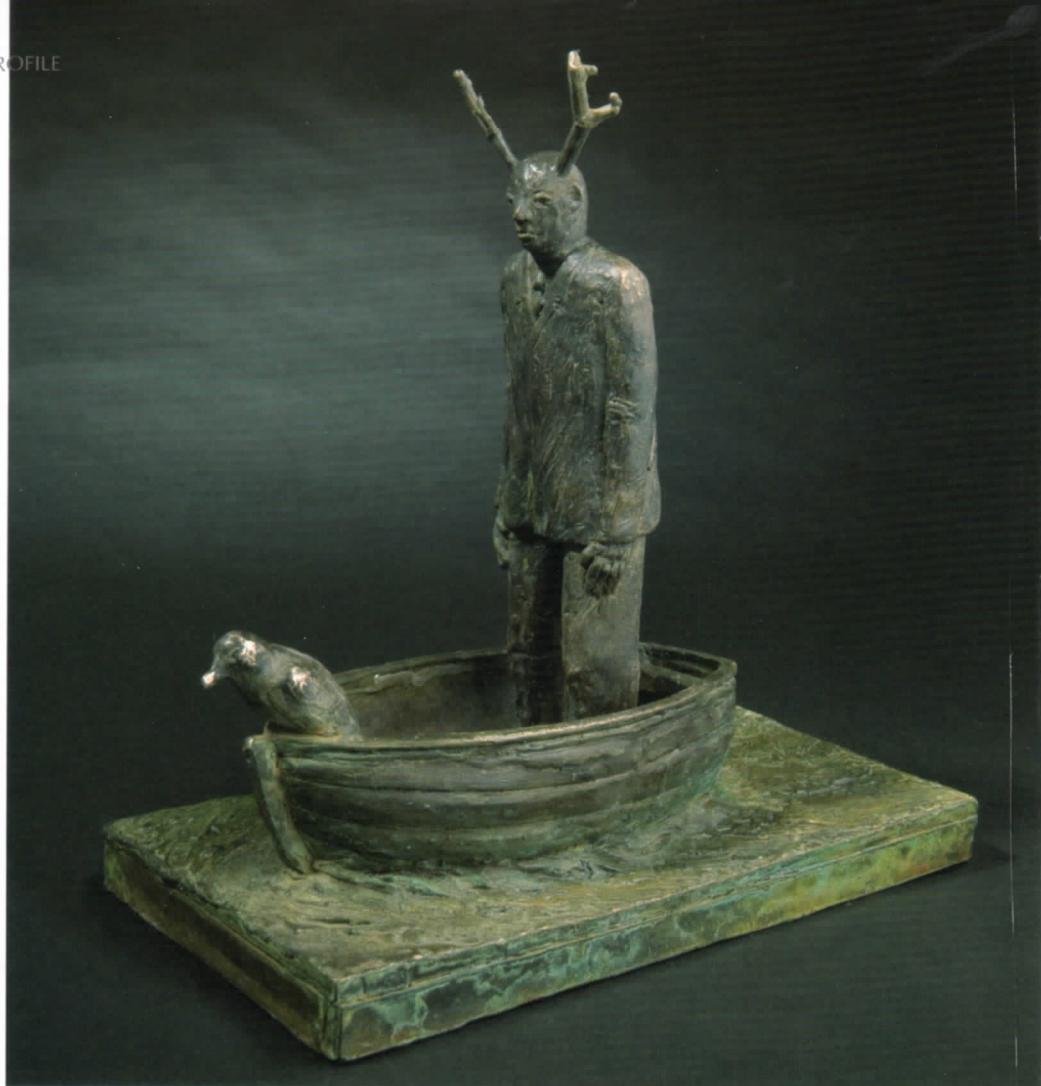
渡 The Crossing 青铜/Bronze 2009年 23×12×13cm