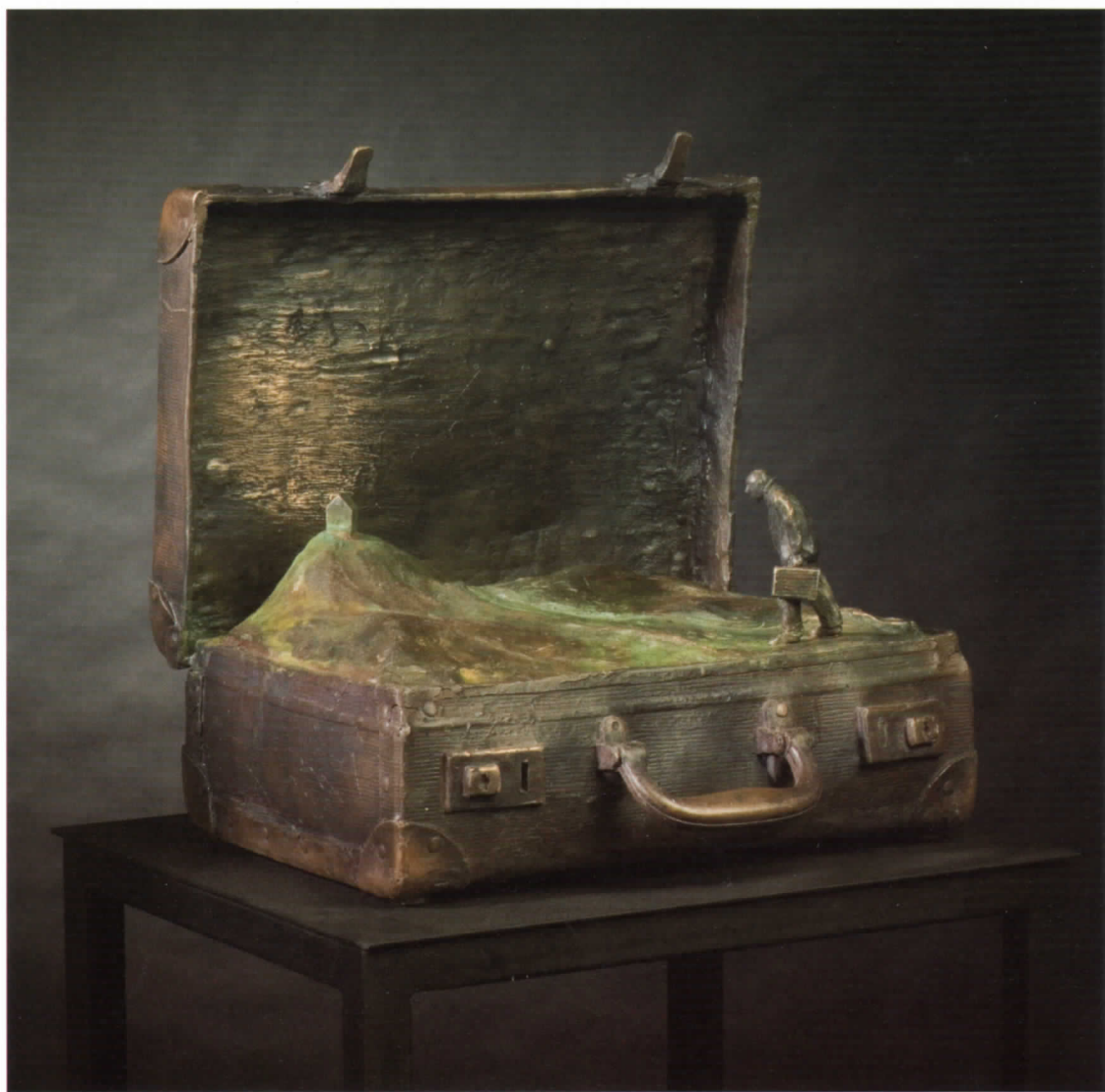
梦游者/Sleepwalker 青铜/Bronze 2009年 34×35×33cm