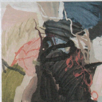
Melissa Boughey, Broke Inlet Wandering (sandy shores, tangled undergrowth), oil and beeswax on board.

11 Rutland Street, Newtown, Geelong VIC 3220 [Map 1] 0417 555 639 0428 305 639 boomgallery.com.au Mon to Sun 9am–4pm.