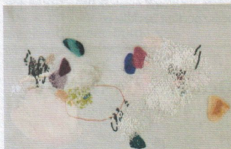
Anna Dunnill, Slow Monuments , 2016, (detail), needle-felted wool, embroidery floss, linen. Courtesy the artist.

Nicholas Building, 714/37 Swanston Street, (enter via Cathedral Arcade lifts, corner Flinders Lane), Melbourne VIC 3000 [Map 2] 03 9650 0093 blindside.org.au Tue to Sat noon–6pm.