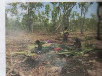
Artists from Bula'bula Arts, Ramingining Northern Territory.

8 Martin Street, St Kilda VIC 3182 [Map 6] 03 9593 9366 brightspace.com.au Weds to Fri 11am–5pm, Sat and Sun noon–4pm. Open over summer by appointment.