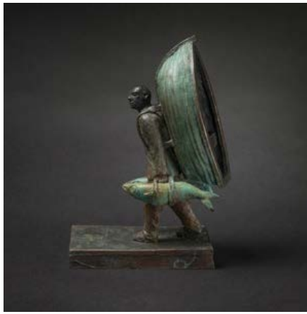
Jon Eiseman Searching For The Lost Ocean 2014 unique bronze 27cm x 18cm x 9 cm