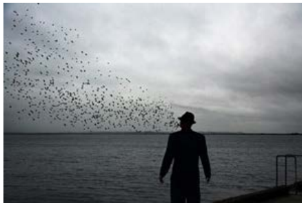
Jon Eiseman Breath 2014 C-Type photograph, unframed, edition of 5. In collaboration with Anne Conron! 67cm x 100cm , also available framed