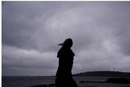
Jon Eiseman Waiting 2014 C-Type photograph, unframed, edition of 5. In collaboration with Anne Conron! 67cm x 100cm , also available framed