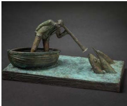
Jon Eiseman The Mariners Dream 2014 unique bronze 18cm x 36cm x 19 cm