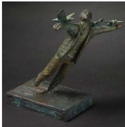
Jon Eiseman Catch The Wind 2014 unique bronze 23cm x 16cm x 10 cm

The uncanny quality of Eiseman's sculptures take on a distinctly more hallucinogenic and dislocated edge in his photographic collaborations with artist Anne Conron. These works feature people wearing animal masks enacting inexplicable scenes that often have a ritualistic overtone, set within nocturnal landscapes. The use of projection, artificial lighting and shadow-play reflects a theatrical and performative sensibility that is the product of these two creative visions combined. Yet while aesthetically divergent from the sculptures, a common symbolic language unites the work in both mediums. The man wearing a bird mask is an example of such