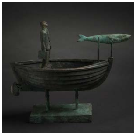
Jon Eiseman! Brother Fish 2014! unique bronze! 36cm x 49cm x 19 cm