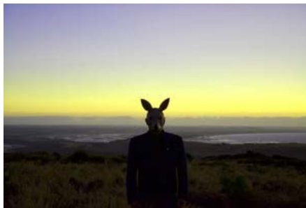
Jon Eiseman Kangel 2014

C-Type photograph, unframed, edition of 5. In collaboration with Anne Conron! 100cm x 67cm , also available framed