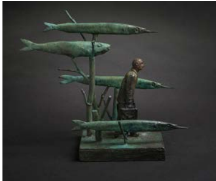
Jon Eiseman Long Way Home 2014 unique bronze 31cm x 38cm x 20 cm