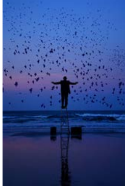
Jon Eiseman The Conductor 2014

C-Type photograph, unframed, edition of 5. In collaboration with Anne Conron! 100cm x 67cm , also available framed