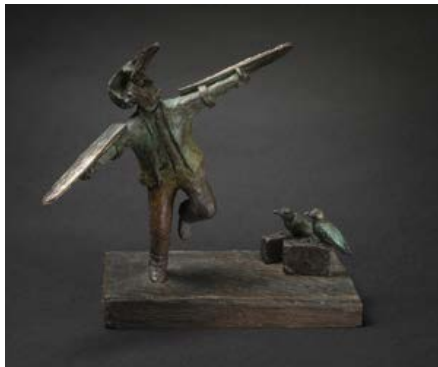
Jon Eiseman Talking To Angels 2014! unique bronze 23cm x 27cm x 17 cm