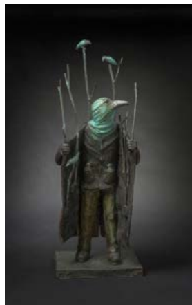
Jon Eiseman! Sanctuary 2014! unique bronze! 67cm x 24cm x 18cm