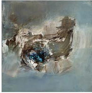
Anne Dupuis Epicentre 2013 mineral pigment, ochre, sumi ink and acrylic on linen 91cm x 91cm