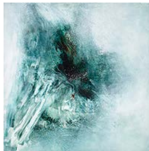
Anne Dupuis Common Thread 2010 mineral pigment, ochre, sumi ink and acrylic on linen 110cm x 110cm