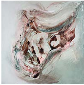
Anne Dupuis Inner Land 2014 mineral pigment, ochre, sumi ink and acrylic on linen 102cm x 102cm