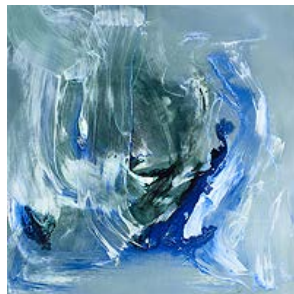
Anne Dupuis Wind Shear 2013 mineral pigment, ochre, sumi ink and acrylic on linen 110cm x 110cm