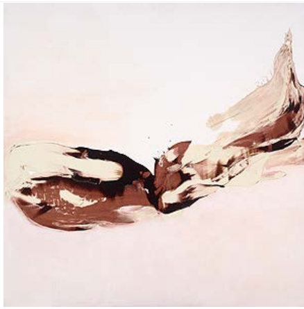
Anne Dupuis Within Earth 2014 mineral pigment, ochre, sumi ink and acrylic on linen 168cm x 168cm