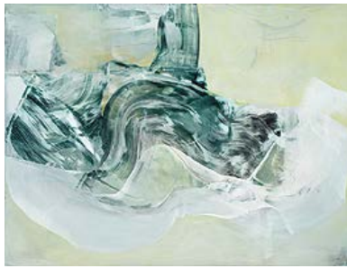
Anne Dupuis Wind Smear 2013 mineral pigment, ochre, sumi ink and acrylic on linen 91cm x 122cm