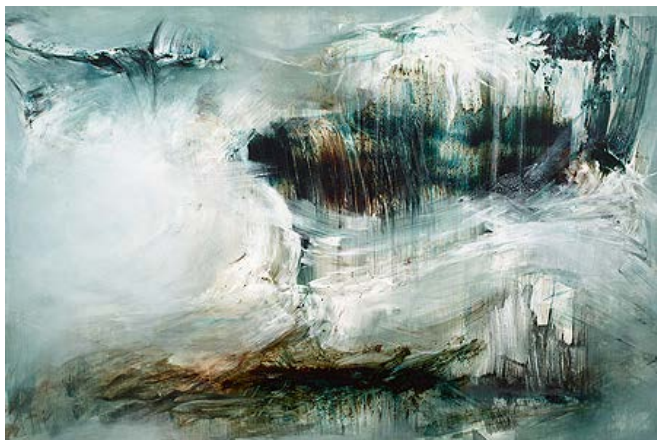
Anne Dupuis Whirlpool 2010 mineral pigment, ochre, sumi ink and acrylic on linen 121cm x 182cm