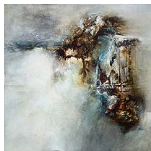
Anne Dupuis Wisdom 2009 mineral pigment, ochre, sumi ink and acrylic on linen 100cm x 100cm