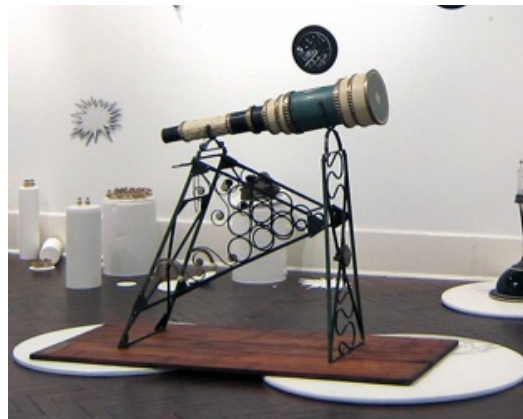
The Telescope, built to see a future (work in progress) Installation views