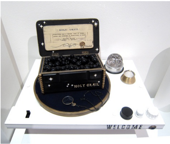
Holy Grail wood, glass, knead it, epoxy, record player, lense, stencil, mirror, road sweeper blades, chain, wax, metal, screws, enamel paint 51 x 38 x 34cm $3,200