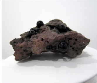
Debris (Rock and Glass) installation view