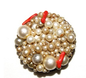
Single Cell Organism (Pearl Brooch) brass (=metal), pearls (=grit, calcium carbonate) 6.5 x 6.5 x 2.5cm $450