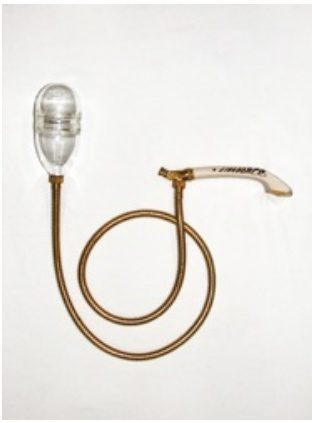
Lifeforce glass, knead it, epoxy, paint, shower head, acrylic, enamel and oil paint 185 x 3.5cm $1800