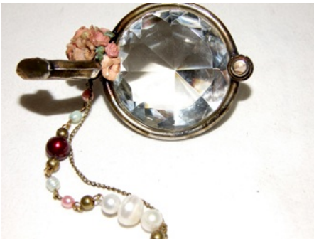
Refraction (Pearl Lens) pearls, brass, glass, paint, metal, chain, knead it, epoxy 47 x 8cm $900