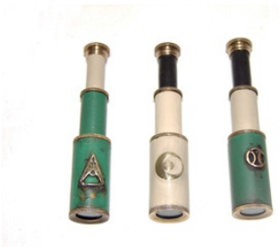
Manufacture (Limited Edition of 3 Telescopes) brass, acrylic and oil paint, epoxy, knead it, metal bits 8.5 x 2cm $650 (each)