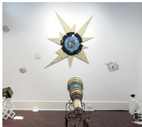
BAnG...! Installation view