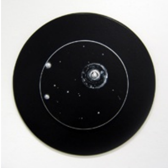
Curiosity (Stars) pearls, wood, oil, acrylic and enamel paint, screw, epoxy 17 x 3cm $750AUD