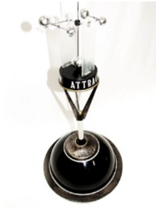
Law (Attraction and Repulsion) epoxy, knead it, leather, telephone cable, acrylic/oil/enamel paint, stencil, plastic, metal bits, wood 80 x 35cm $1,200