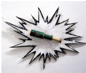
Manufacture (Limited Edition of 3 Telescopes) Installation view