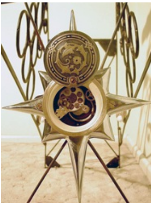
The Telescope, built to see a future (work in progress) cake tins, wood, oil/acrylic/enamel paint, screw, epoxy, ironing board frame, wine racks, pearls, metal bits, buttons, sewing machine parts, watch parts, glass, belt fans 114 x 108 x 32 POA