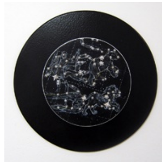
Mapping/Measurement (Astronomy) The Modern Map pearls, wood, oil, acrylic and enamel paint, screw, epoxy, wire 33 x 1.5cm $1,000