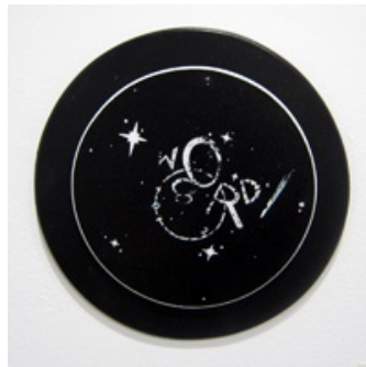
Shape (Letter and Words) wood, oil, acrylic and enamel paint, screw, epoxy 32 x 1.5cm $600