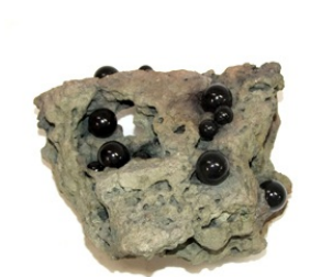
Debris (Rock and Glass) rock (=stardust), glass (=etc), watercolour, epoxy, knead it 26 x 23 x 12cm $900