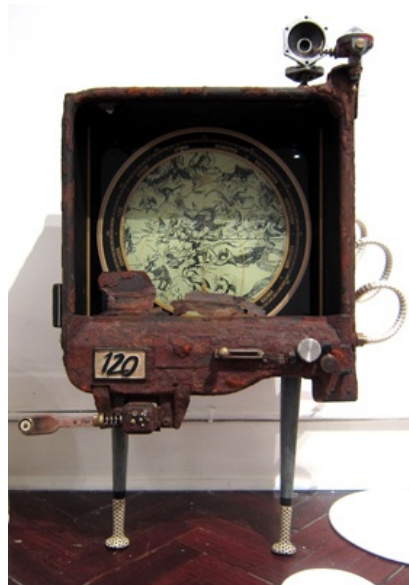
Horriscopes, built to frame a future Installation view