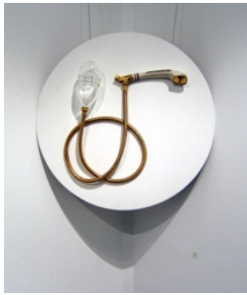
Lifeforce installation view