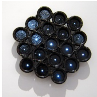
Division (Cell Light Sculpture) wood, epoxy, oil/enamel paint, bitumen, pearls, knead it, lights, beads 37 x 37 x 6cm $1200