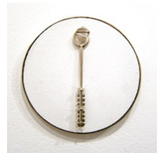
Security System (Silver) Installation view