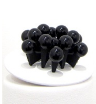
Molecule (Paper Weight) installation view