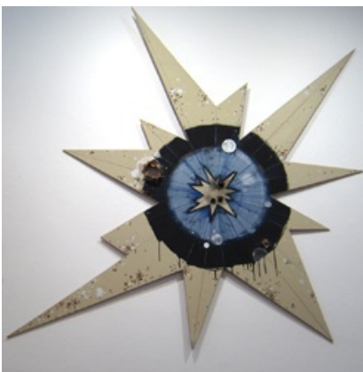
BAnG...! MDF (=wood, tree), paint (=pigment, light reflection), glass (=sand) 185 x 185cm $1,200