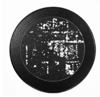
Electricity (City Lights) wood, oil, acrylic and enamel paint, screw, epoxy 17 x 1.5cm $600