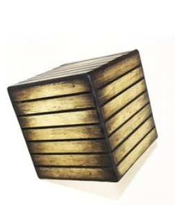
Unidentified Object!?' (Form) knead it (=stuff), plastic (=organic/inorganic compounds) 18 x 18 cm $900