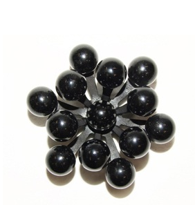
Molecule (Paper Weight) glass (=silica), sodium oxide, lime, steel (=metal) 13 x 13 x 6.5cm $700