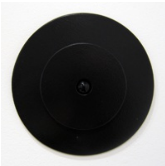
Cell (Glass and Wood) wood, glass, epoxy, enamel paint 27 x 4cm $500