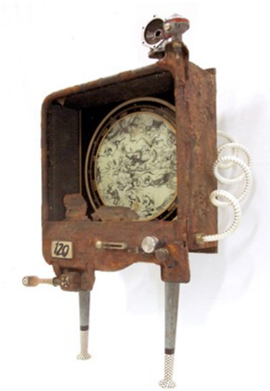
Horriscopes, built to frame a future wood, car parts, astronomy table top, spring, pipe, enamel, oil and acrylic paint, epoxy, knead it, screws, liquid nails, knob, beads, bits 90 x 65 x 44cm POA