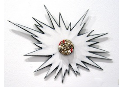
Single Cell Organism (Pearl Brooch) installation view