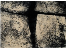
Four parts of a retaining wall, part 1 2011 carborundum print, edition of 5 39cm x 55cm