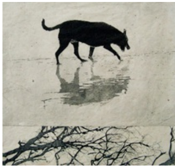
Sighting the object 2011 2 plate etching on handmade paper, edition of 5 (2 of 5 editions remaining) 52cm x 54cm