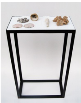
Continental Shelf #2 Steel, felt, stoneware, and found objects