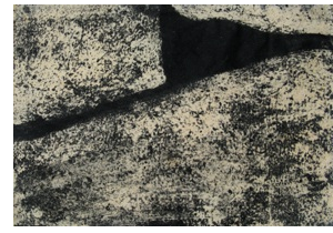
Four parts of a retaining wall, part 4 2011 carborundum print, edition of 5 39cm x 55cm