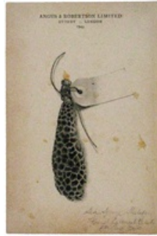
Neap Tide, Sea Sponge Graphite on reclaimed page 20cm x 13.5cm