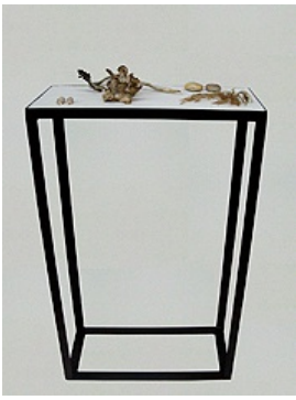
Continental Shelf #3 Steel, felt, stoneware, and found objects