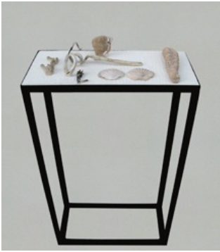
Continental Shelf #4 Steel, felt, stoneware, and found objects