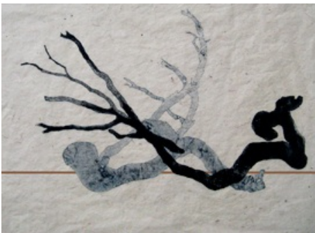
Remnants 2011 2 plate etching on handmade paper, edition of 5 (4 of 5 editions remaining) 48cm x 54cm