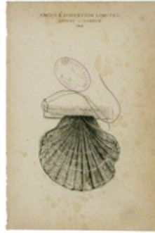
Neap Tide, Scallop Shell Graphite on reclaimed page 20cm x 13.5cm