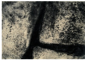
Four parts of a retaining wall, part 2 2011 carborundum print, edition of 5 39cm x 55cm