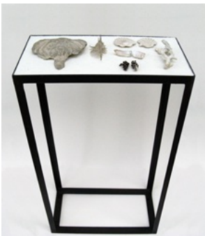
Continental Shelf #1 Steel, felt, stoneware, and found objects