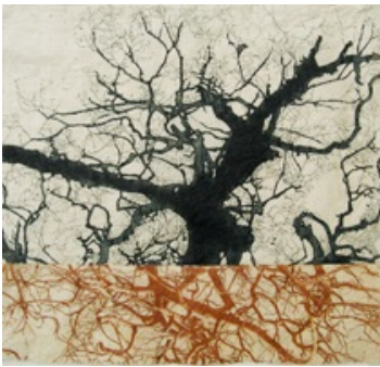
Three trees have fallen 2011 2 plate etching on handmade paper, edition of 5 (4 of 5 editions remaining) 52cm x 54cm