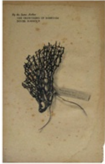
Neap Tide, Black Coral Graphite on reclaimed page 20cm x 13.5cm