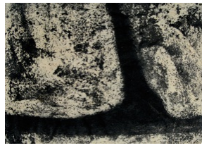
Four parts of a retaining wall, part 3 2011 carborundum print, edition of 5 39cm x 55cm