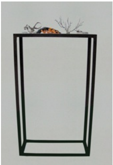
Continental Shelf #5 Steel, felt, stoneware, and found objects