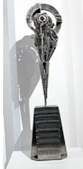
Sundown stainless steel & basalt 91 x 22 x 11cm