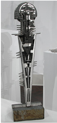
Pharaoh 110 x 30 x 26cm stainless steel, basalt