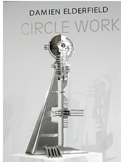
Eclipse 74 x 40 x 18 stainless steel, basalt