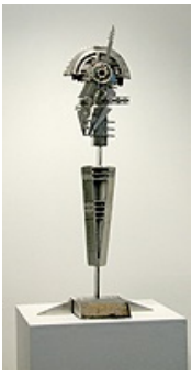
Noctuidae Stainless steel & basalt 87 x 35 x 32cm