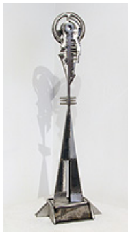
Untitled stainless steel & basalt 63 x 21 x 18cm