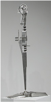
Element 2 115 x 51 x 19 stainless steel, basalt