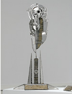
Tidal Lines 80 x 40 x 35 stainless steel, basalt