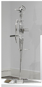
Elements 1 104 x 49 x 14 stainless steel, basalt