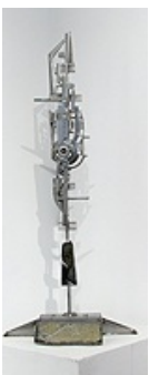
Pythagoras Stainless steel & basalt 93 x 40 x 28cm