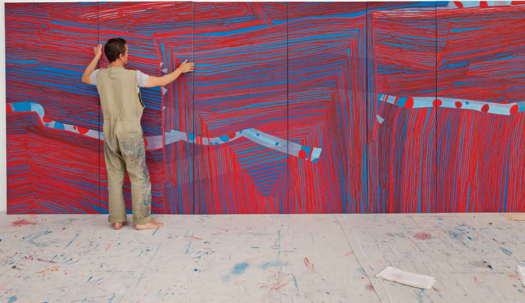
Christophe Stibio in his studio with Where were you when it happened #16 2010 natural pigments on paper mounted on cotton duck 230 x 530 cm